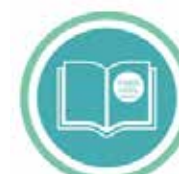
Customer Communications Group

The Irwell Valley Foundation is our charitable investment fund supporting customers and communities where we have homes. Join the panel to help decide how we spend this funding.