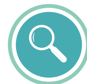
Resident Scrutiny Panel Member

Our work is overseen by a Board of Management. They agree and set our priorities and monitor our performance, finances, and risks to ensure we meet our regulatory requirements and operate effectively. By becoming a board member, you will use your voice at the highest level of our organisation.