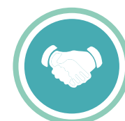
Customer Board Member

From regular meetings to ad-hoc opportunities, here's how you could get on board: