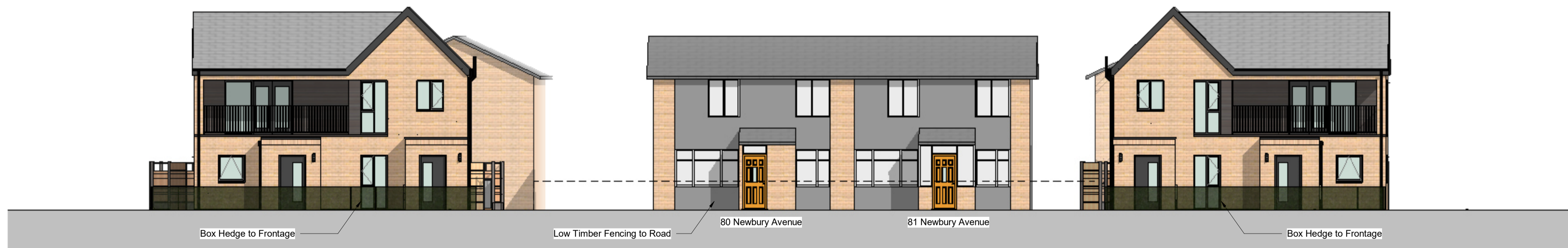
A Proposed Phase 2 - Zone B - Street Elevation A Scale @ 1 : 100