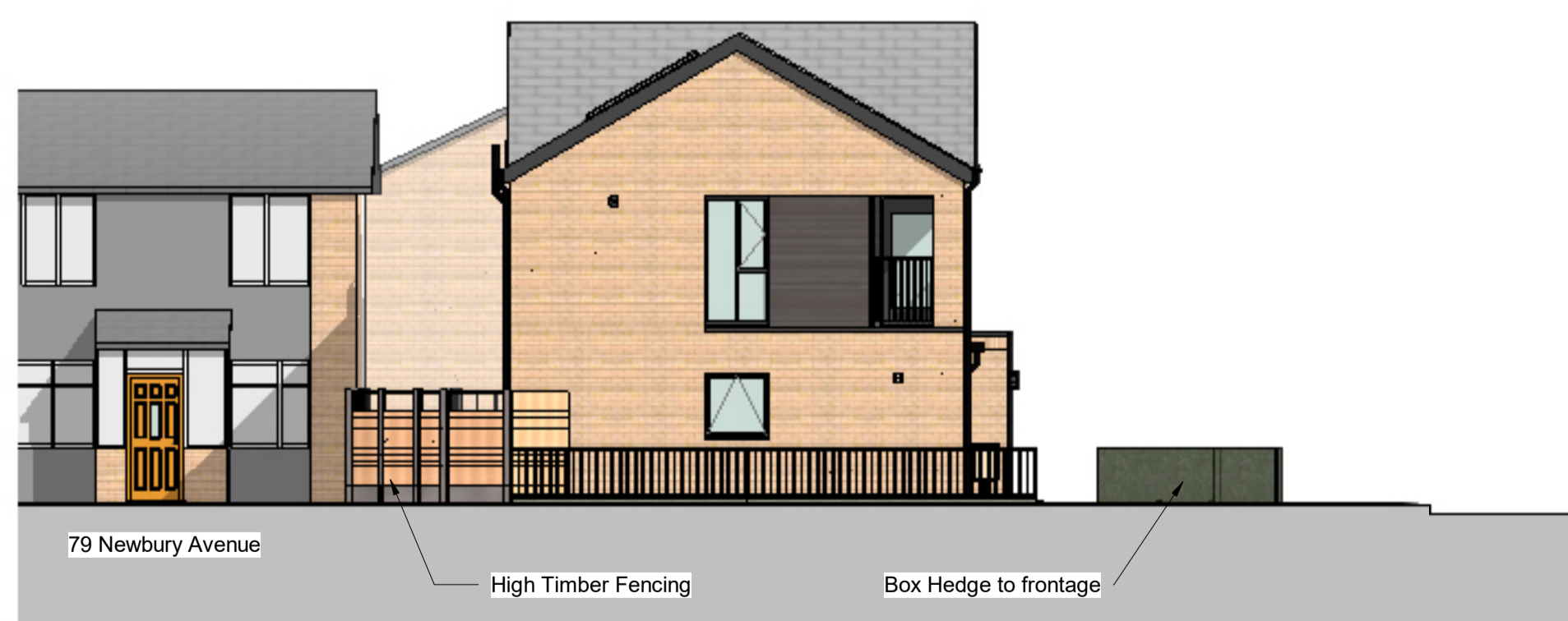
B Proposed Phase 2 - Zone B - Street Elevation B Scale @ 1 : 100