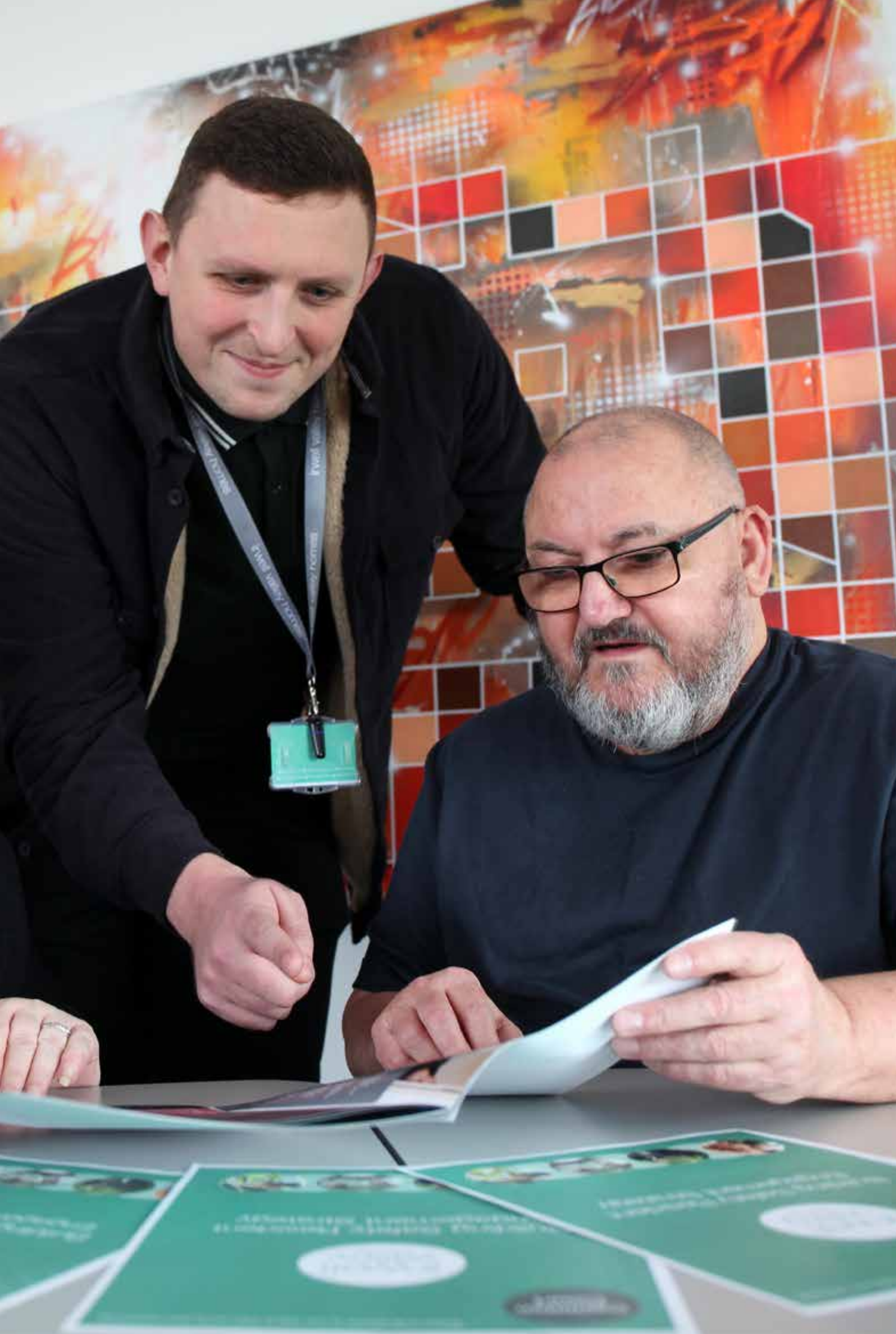
measuring and reviewing participation