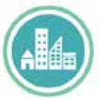
Building Safety Forum

Who review and challenge how well our services are performing, including performance against the Tenant Satisfaction Measures.