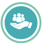
Customer Standards Group

Who take a deep dive into different service areas to review how it works and report their findings and recommendations to our board of management.