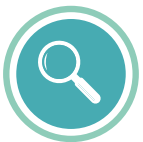
Resident Scrutiny Panel

We currently have spaces on all of our customer groups including: